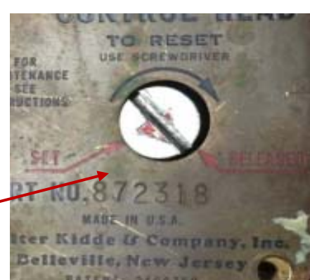
The slot and arrow indicator on the reset component above aligns with the status of the CO<sub>2</sub> bottle.