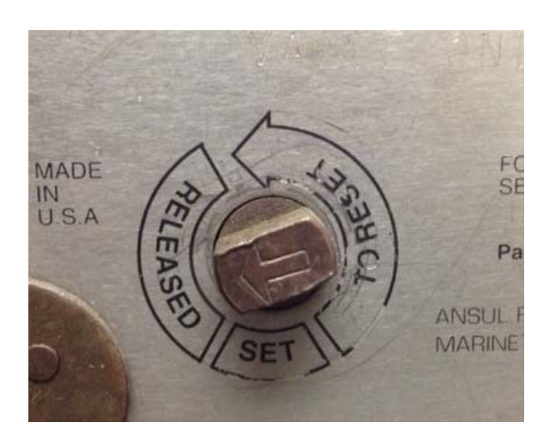
Pictured above is a release indicator for an ANSUL system.

The photo on the right is an example of a second visual indicator for checking system status. It indicates the pressure switch position for the CO<sub>2</sub> system. If the indicator is in the down "SET" position, no CO<sub>2</sub> has been released and the system is ready for operation. If the indicator is in the up position, it indicates that the system has been "OPERATED" and that the proper servicing company should be contacted immediately to bring the system back to readiness.